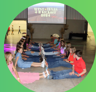
West Texas 4-H Kickoff